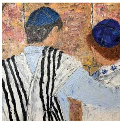
Father & Son