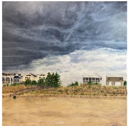
Beach Storm 2