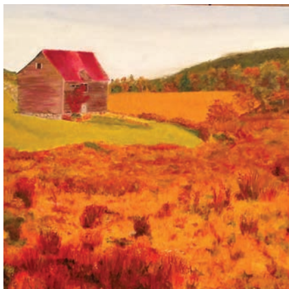
Colors of Nature