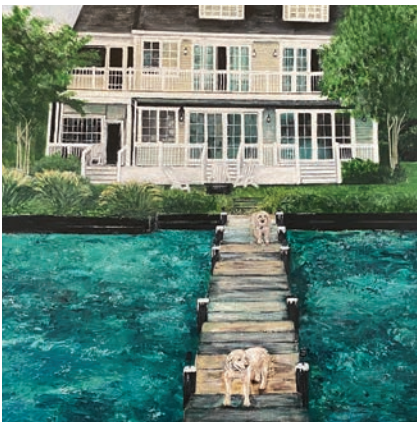
Standing on the Dock of the Bay