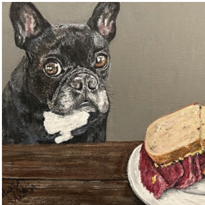
Corned Beef on Rye