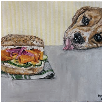
Bagel & Lox