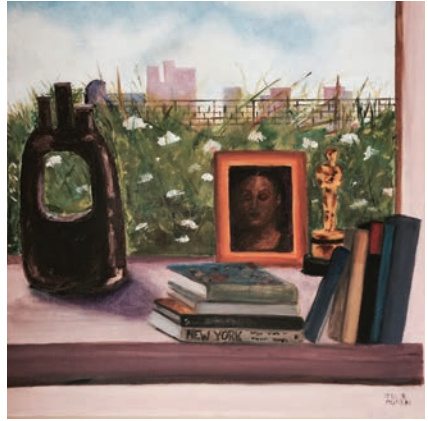
And The Oscar Goes To