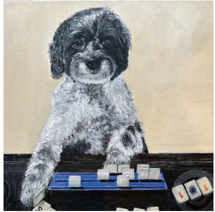
Forced Family Fun