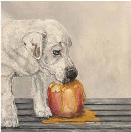
Apples and Honey