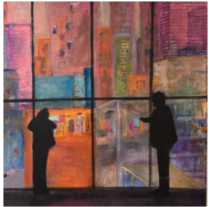
Windows to the World