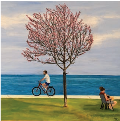
Spring on the Potomac