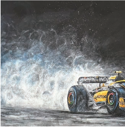
Driving to Survive