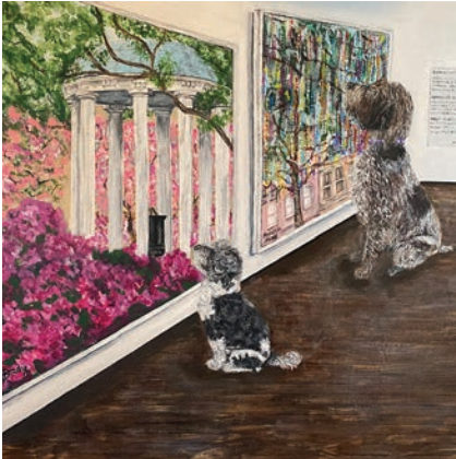
A Night At The Dog Museum