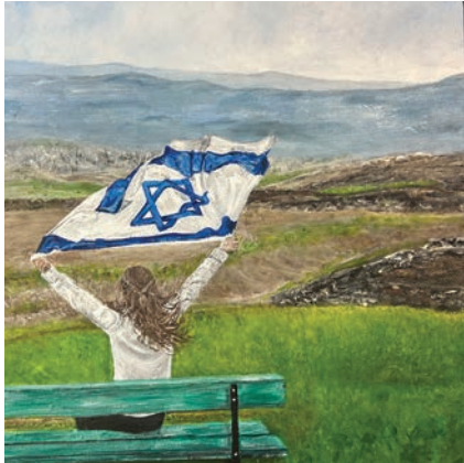
Am Yisrael Chai