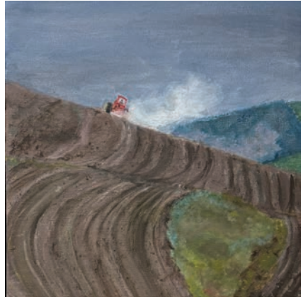
Reap What You Sow