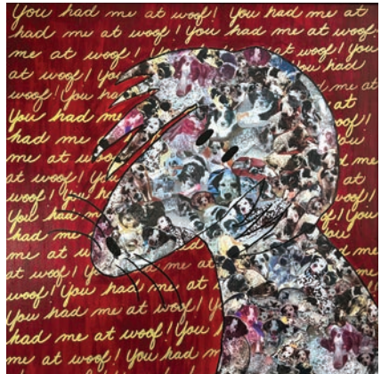
You Had Me At Woof