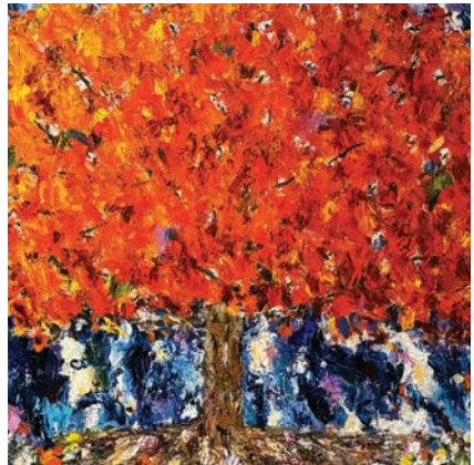
Autumn Tree of Life