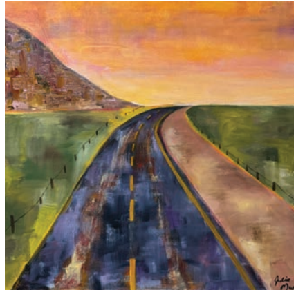
Road to Nowhere