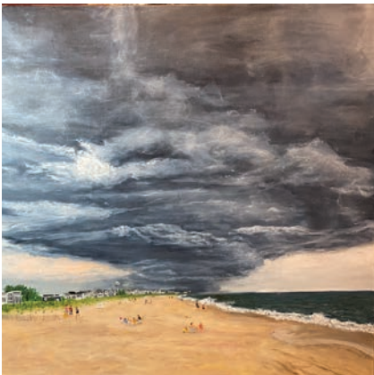
Beach Storm 1