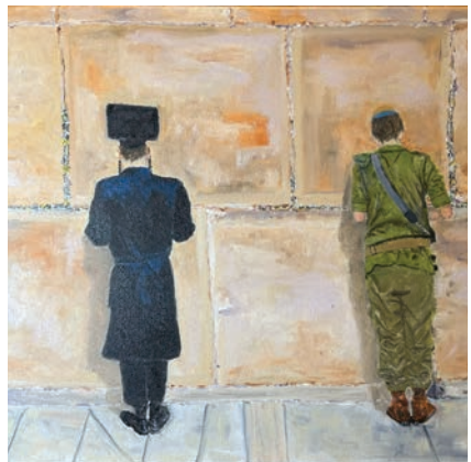
Prayer for Peace