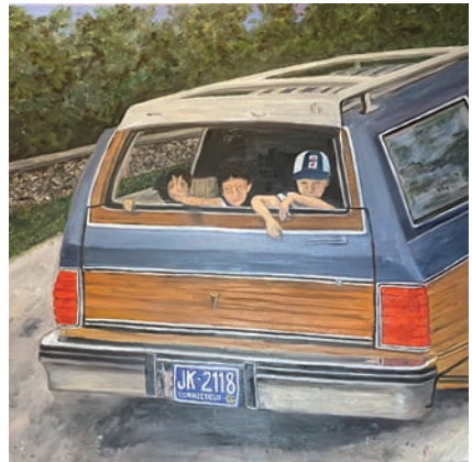
Going to Grandmas