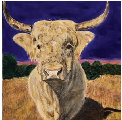
Hey Yak Kerouac