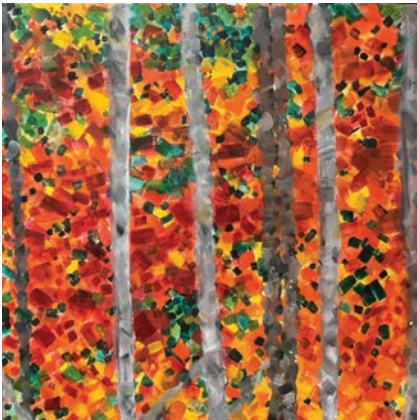
Seeing the Forest for the Trees