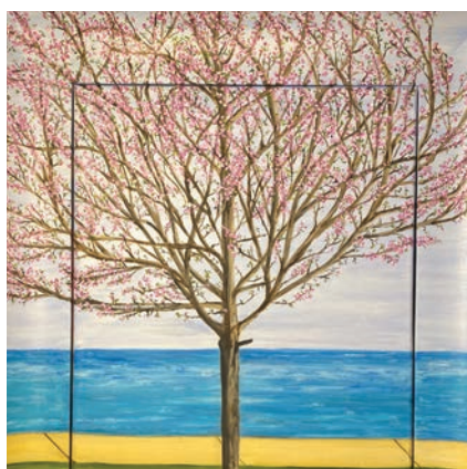
DC Tree of Life