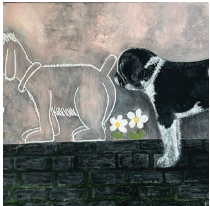
How You Doing