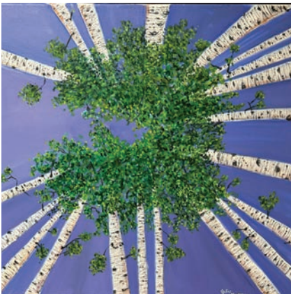
Tall & Mighty