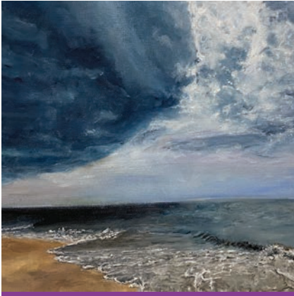
Beach Storm 3