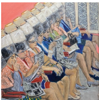
Day of Beauty