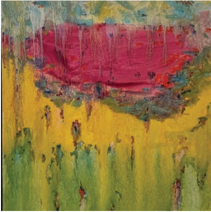
A Slice of Red