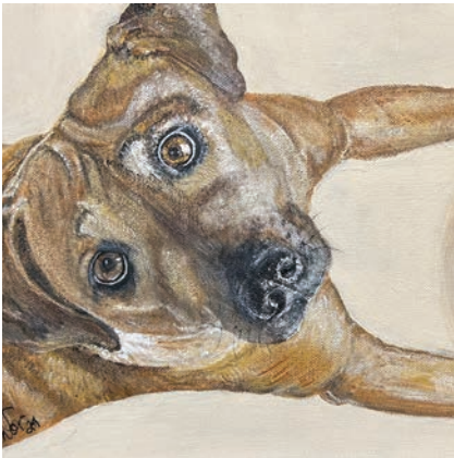
Grandma's Chicken Soup