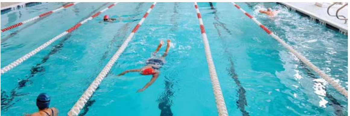
The Bender JCC Herman Aquatic Center – Indoor Pool