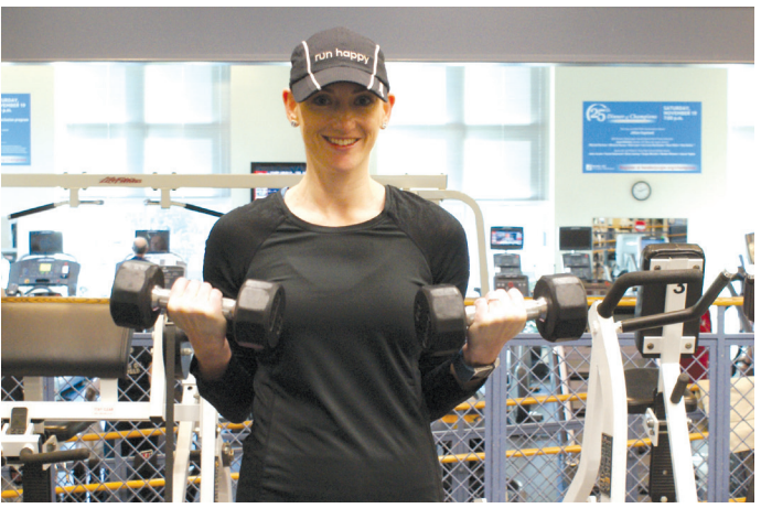
...that promotes healthy bodies and minds.