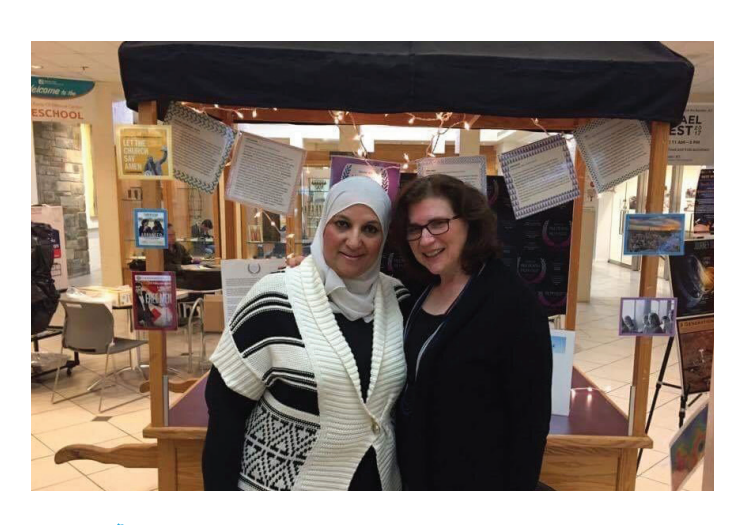
...that is welcoming to all.