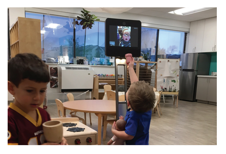
...that creates meaningful connections.

The support that our generous donors provides has a direct and immediate impact on the lives of so many individuals and families in our community.