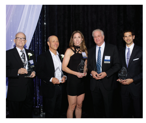
Sports Hall of Fame inductees and JCC Maccabi Legacy Award recipient