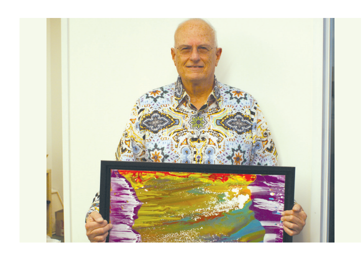
...that inspires creativity.