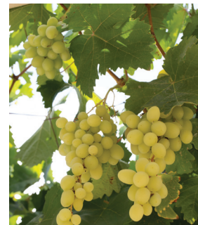
© Itamar Grimberg, Israeli Ministry of Tourism